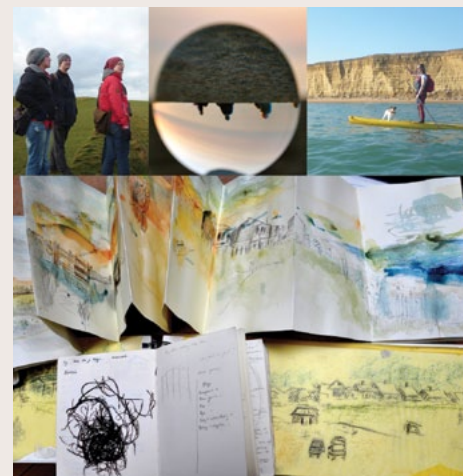
Proboscis: research images on Hive Beach