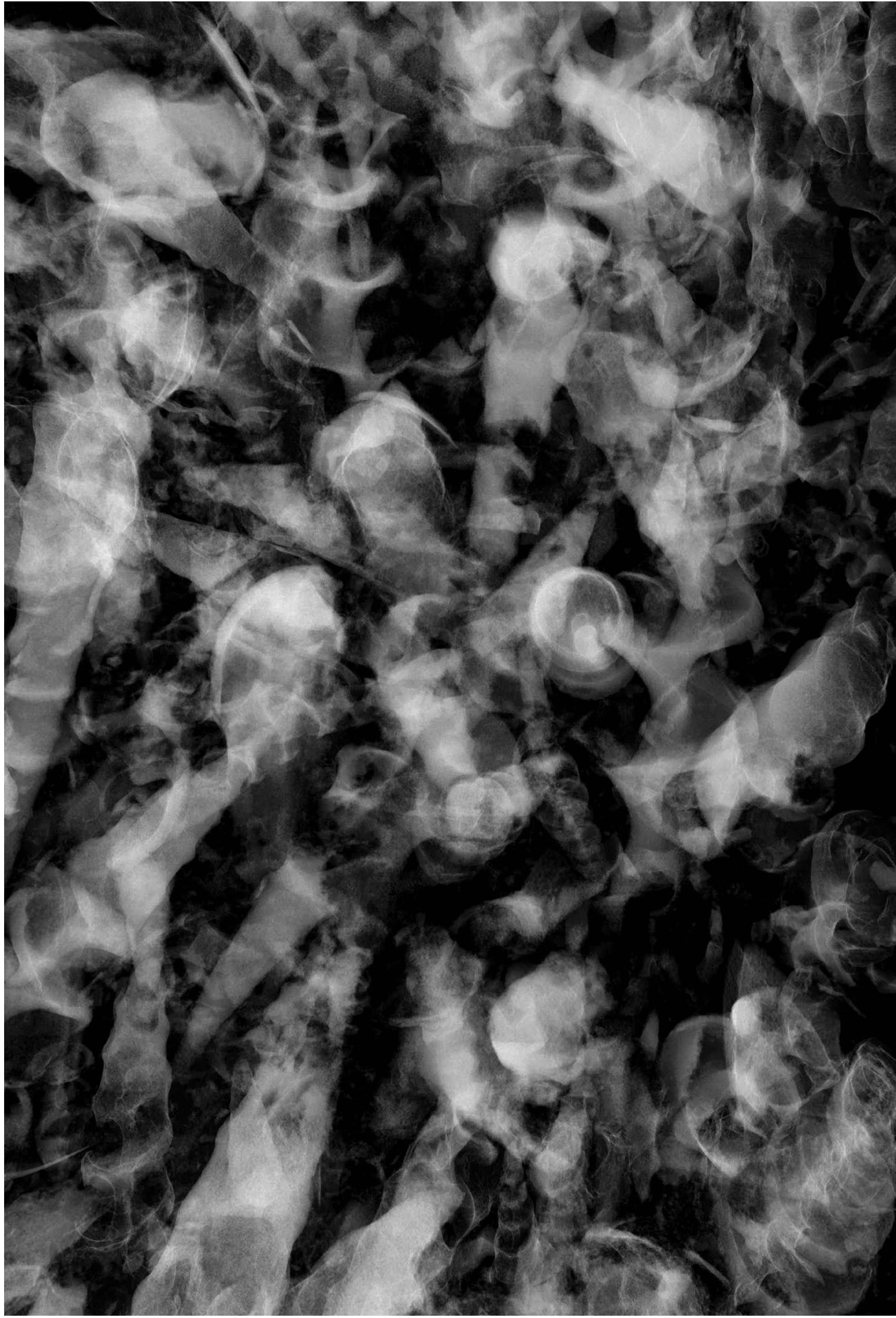
A CT scan of a cylinder of Portland roach stone, carried out by the University of Southampton, reveals a cloud of shells, including the spiral shape of the so-called Portland screw ( Aptyxella portlandica ) a small snail from the Jurassic.