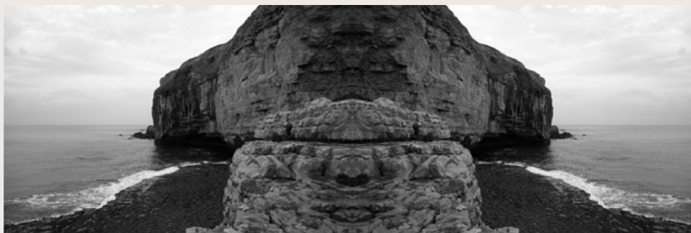
Mat Chivers: composite research image of Dancing Ledge, Purbeck.

text+work is a gallery initiative that invites artists to develop exhibitions and events. This has forged partnership with writers and critics who provide supportive narrative in the form of published text to accompany the exhibitions.