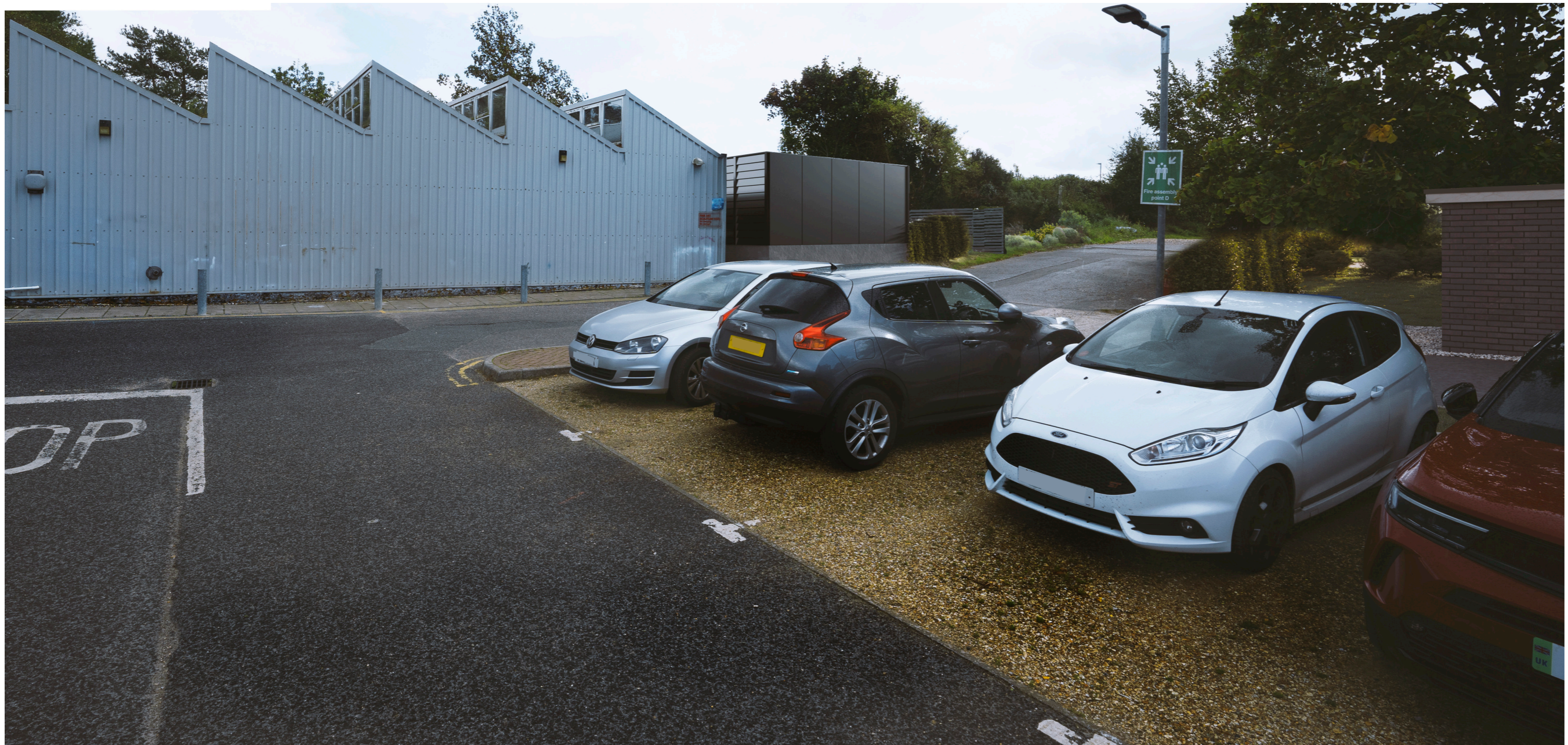
Visualisation of propose plant enclosure and sub-station taken from Campus car park