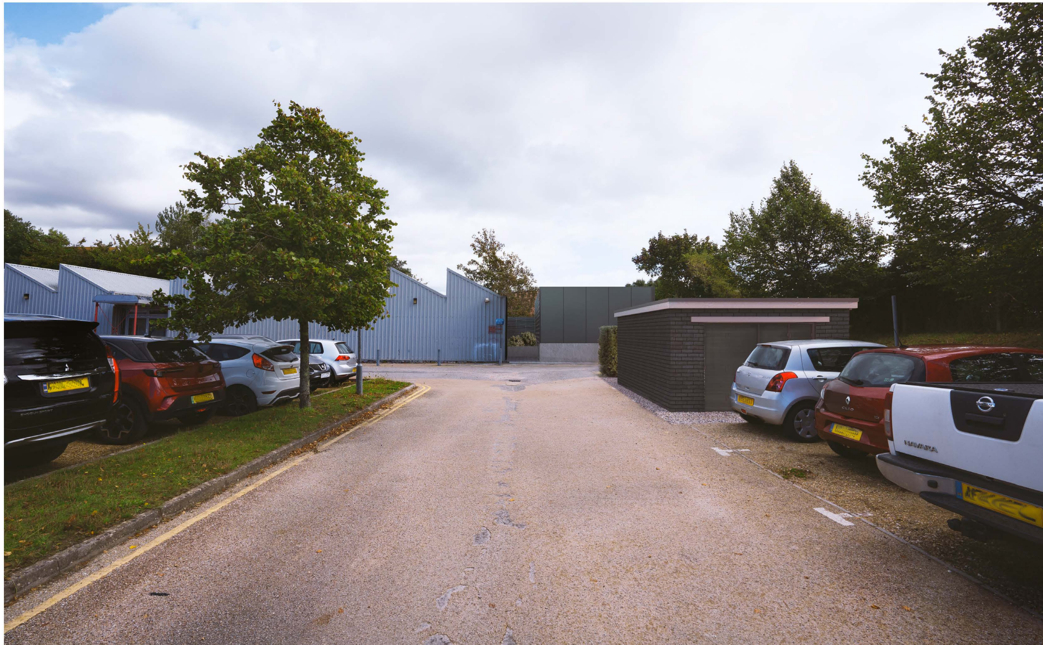
Visualisation of proposed Salix plant enclosure and sub-station looking from the car park towards the North Lights Studio