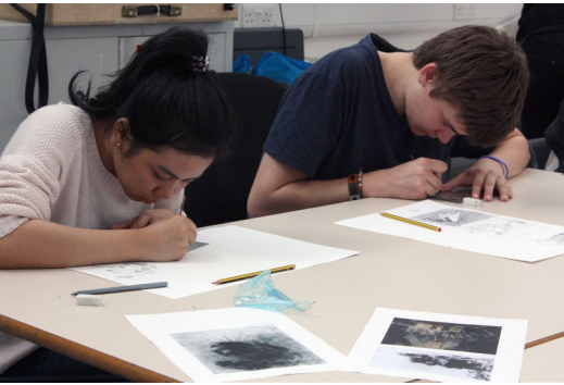
Illustration is all about finding visual solutions to communicate an idea, message or text. This course is designed to give you a solid understanding of the fundamentals of illustration and encourages you to develop your personal identity through your drawing.