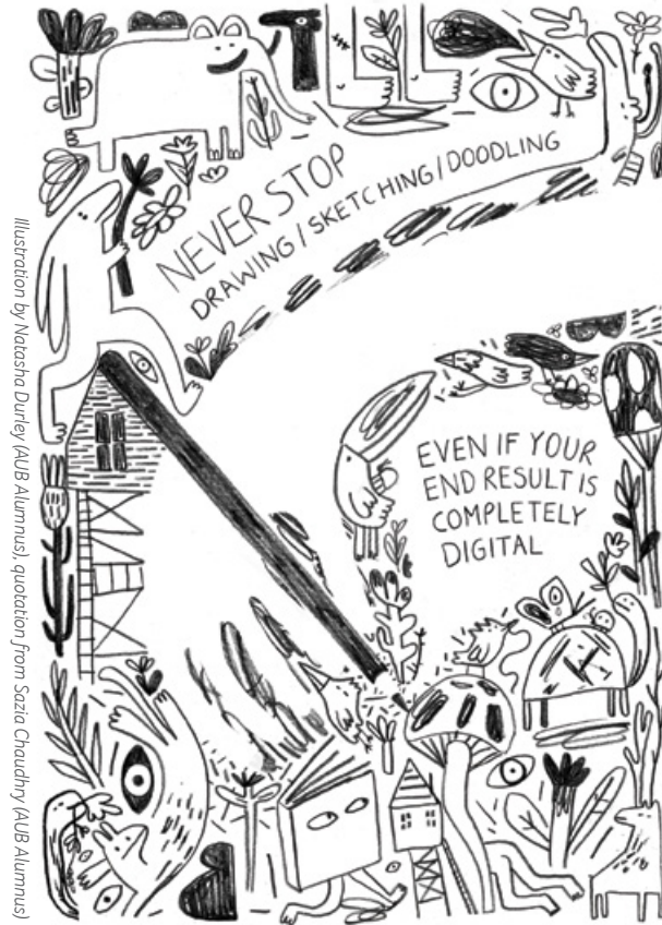
Illustration by Natasha Durley (AUB Alumnus), quotation from Sazia Chaudhry (AUB Alumnus)