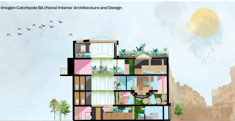
Imogen Catchpole BA (Hons) Interior Architecture and Design

If you have additional queries, please contact one of our Student Services Advisers on accommodation@aub.ac.uk or call +44 1202 363780