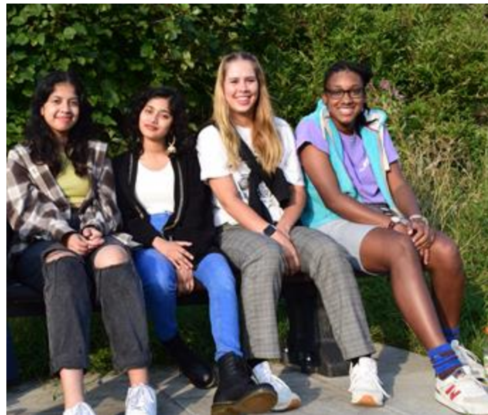
Youth Collective, 2021

73% of young members say that Arts Emergency makes them feel like part of a community