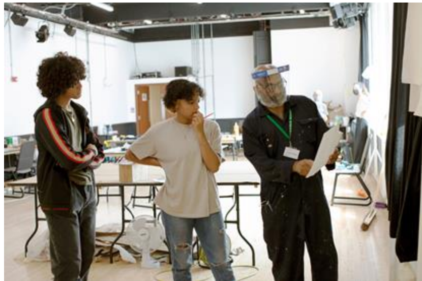
On-site placement at Output Arts

“Having a mentor to just say ‘this isn’t over and we’ll come back fighting as an industry’ really helped me cope.”