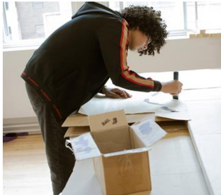
Young Talent member on work experience

Our community and mentors offer a crucial gateway into hard-to-crack industries like museums, TV, publishing and architecture.