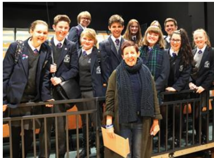
Julie Hesmondhalgh at Ashton Sixth Form College