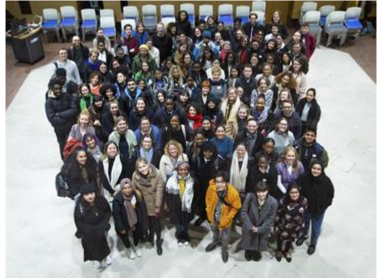
Mentors pairs meet for the first time, 2020

We work with partner schools with high pupil premium, further education colleges and referral partners to find the young people who could most benefit.