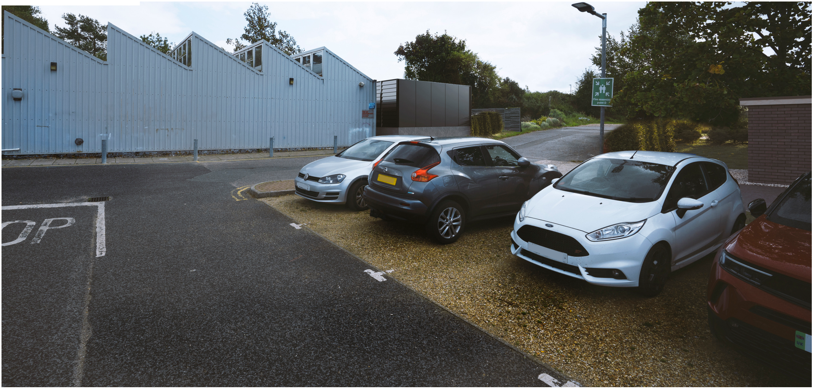
Visualisation of propose plant enclosure and sub-station taken from Campus car park